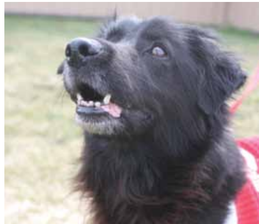
Wynter—her playful nature will bring a smile to your face!

And as for Wynter... she is ready for adoption! Please stop by to meet her and the many volunteers who are helping to make her dream come true. 🐾